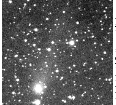
<u>Place:</u> Dax Observatory (IAU code: 958) <u>Date:</u> 28/08/98 <u>Instrument used:</u> LX200, F/D=3,3 <u>Camera:</u> Hisis 22, 12 bits <u>Exposure:</u> 540s (9 exposures of 60s) <u>Picture field:</u> 19'x17' Binning 1x1, without filter

Picture taken in the night of the 28th of august 1998.